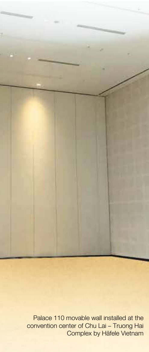
Palace 110 movable wall installed at the convention center of Chu Lai – Truong Hai Complex by Häfele Vietnam