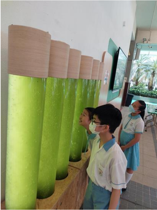
Kwong Ming Ying Loi School