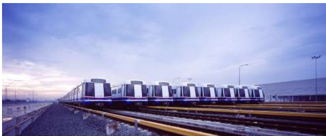
CH. Karnchang played a key role in constructing the MRT system in Bangkok

Covering Mass Rapid Transit System, Airport, Road and Expressway, Energy, Water Supply and Harbor, and Building, the company has been increasingly recognized and trusted by leading organizations, with the ability to manage sophisticated megaprojects at the regional levels where all advanced construction and engineering technologies are needed.